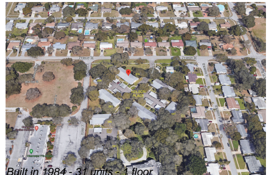
Built in 1984 - 31 units - 1 floor