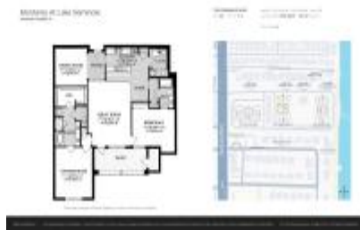
Built in 2007 - 96 units - 4 floors