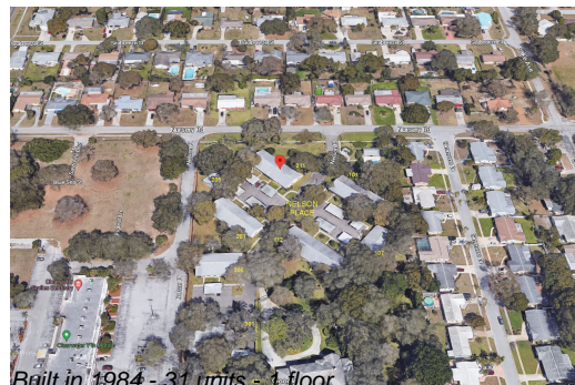
Built in 1984 - 31 units - 1 floor