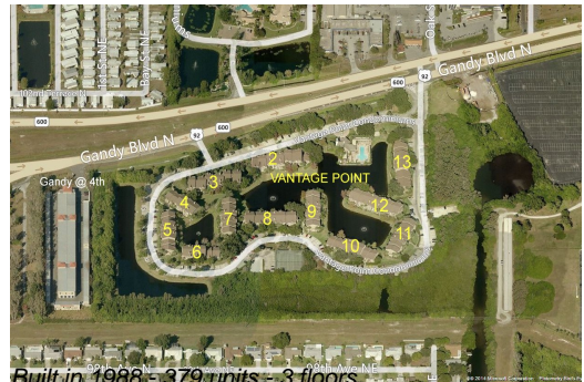
Built in 1988 - 379 units - 3 floors