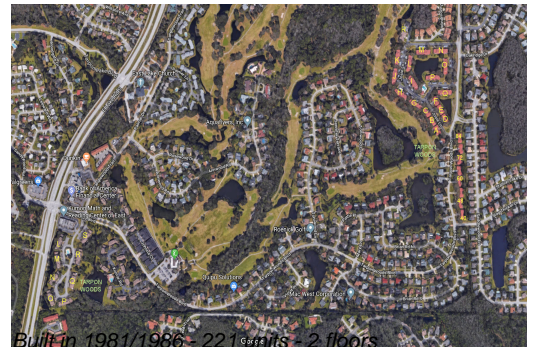
Built in 1981/1986 - 221 Units - 2 floors