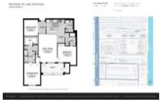
Built in 2007 - 96 units - 4 floors