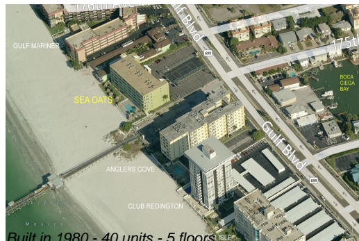
Built in 1980 - 40 units - 5 floors