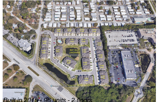
Built in 2015 - 96 units - 2 floors