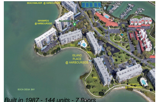
Built in 1987 - 144 units - 7 floors