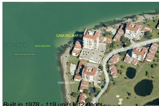
Built in 1978 - 119 units - 12 floors