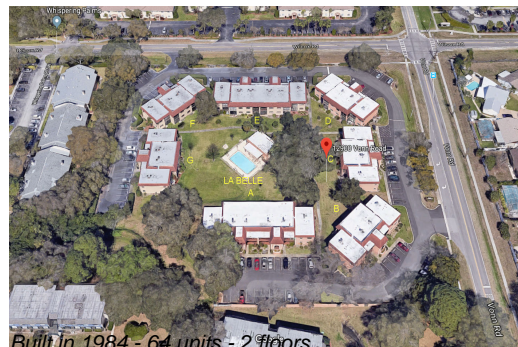
Built in 1984 - 64 units - 2 floors