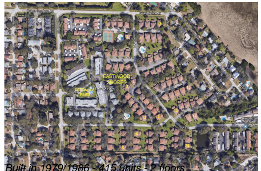
Built in 1979/1986 - 415 units - 2 floors