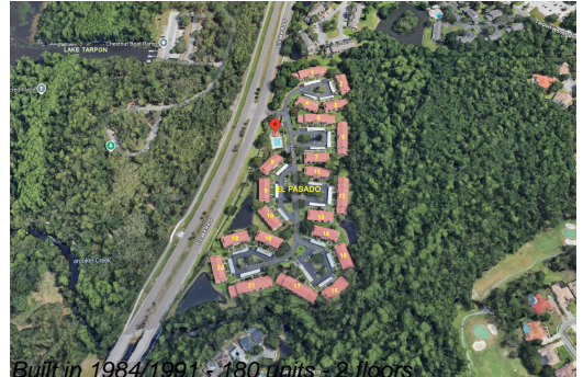
Built in 1984/1991 - 180 units - 2 floors