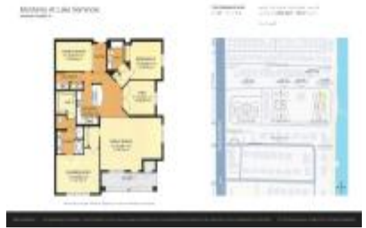
Built in 2007 - 96 units - 4 floors