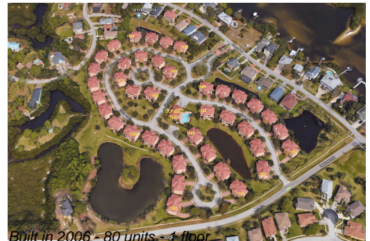
Built in 2006 - 80 units - 4 floor