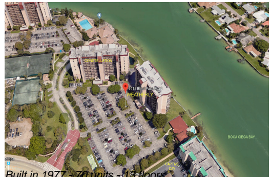
Built in 1977 - 70 units - 13 floors