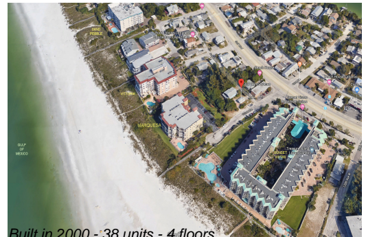
Built in 2000 - 38 units - 4 floors