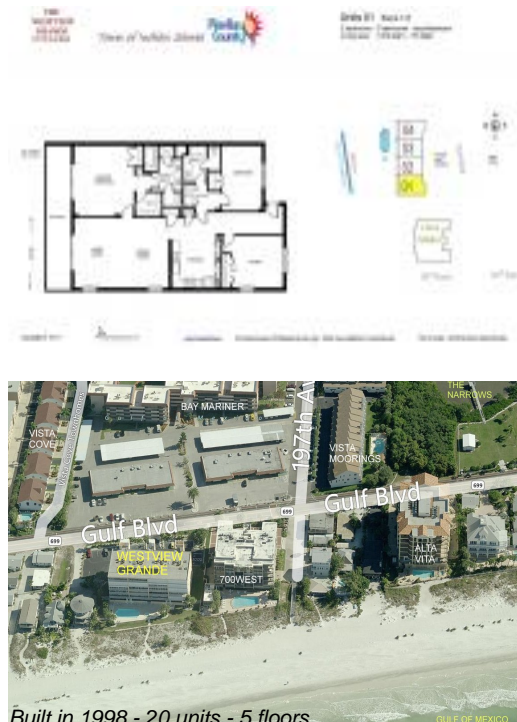
Built in 1998 - 20 units - 5 floors

Westview Grande n/a Indian Shores 138 days Pinellas 99 days