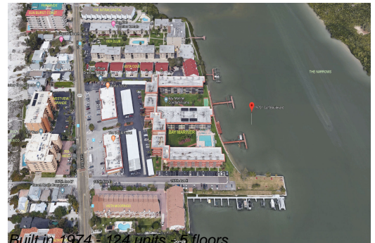
Built in 1974 - 124 units - 5 floors