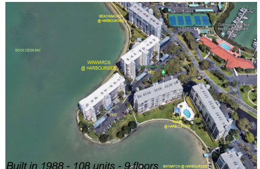
Built in 1988 - 108 units - 9 floors