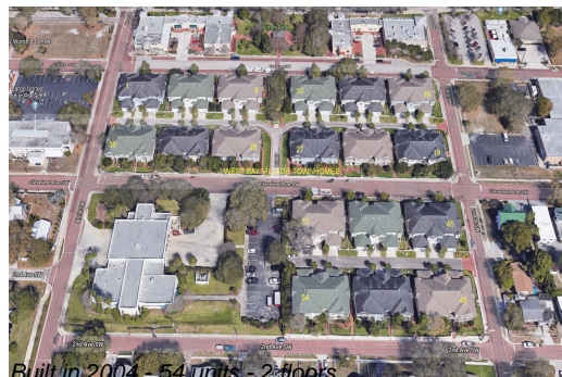
Built in 2004 - 54 units - 2 floors