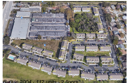
Built in 2004 - 112 units - 2 floors