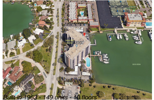
Built in 1963 - 149 units - 10 floors

The above valuated price is a baseline figure that does not take into account any specific renovation, upgrade, split, merge, or deterioration of the unit.