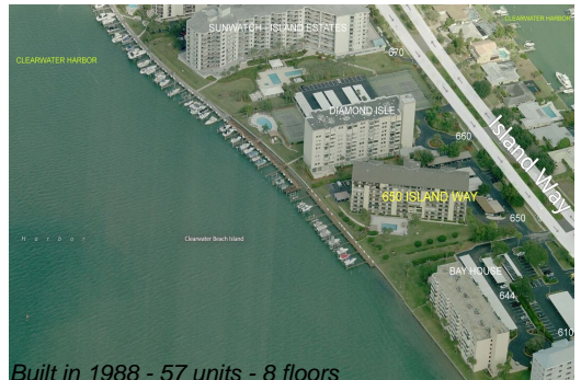
Built in 1988 - 57 units - 8 floors