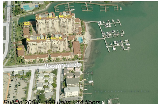
Built in 2004 - 199 units - 14 floors