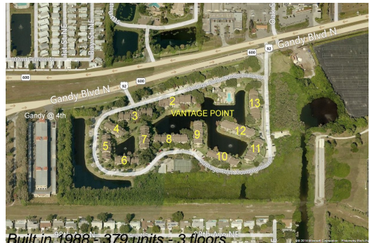
Built in 1988 - 379 units - 3 floors