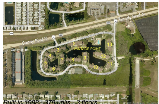
Built in 1988 - 379 units - 3 floors