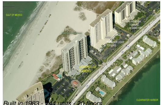
Built in 1983 - 144 units - 20 floors