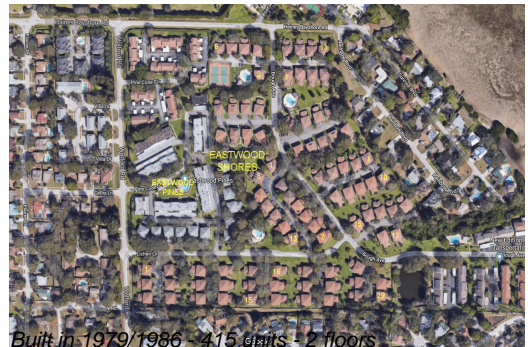
Built in 1979/1986 - 415 units - 2 floors