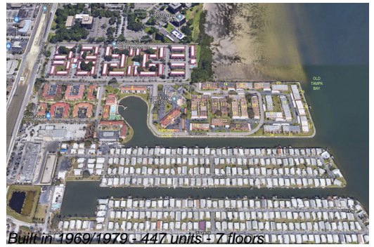
Built in 1969/1979 - 447 units - 7 floors

MLS Number: U8198148 Status: ACTIVE Size: 1,060 Sq ft. Bedrooms: 2 Full Bathrooms: 2 Half Bathrooms: 0 Parking Spaces: View: Rental Price: $2,450 List PPSF: $2