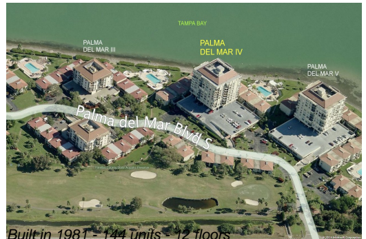
Built in 1981 - 144 units - 12 floors