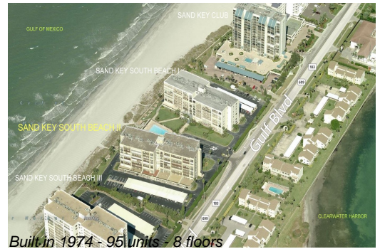
Built in 1974 - 95 units - 8 floors