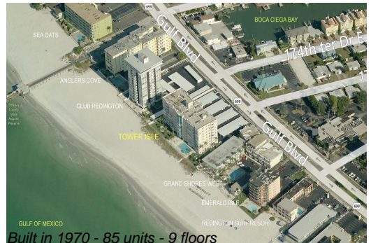
Built in 1970 - 85 units - 9 floors