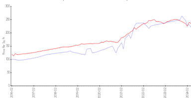
Town Shores of Gulfport - Jamison House vs Gulfport