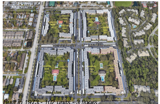
Built in 1973 - 102 units - 3 floors