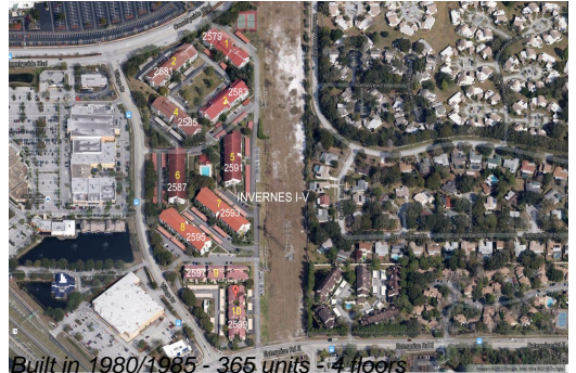
Built in 1980/1985 - 365 units - 4 floors