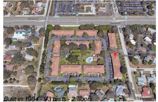
Built in 1984 - 93 units - 2 floors