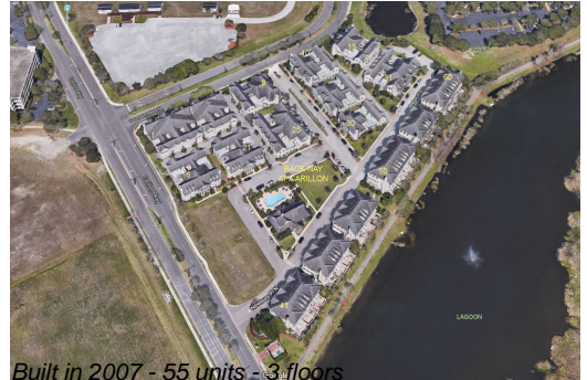
Built in 2007 - 55 units - 3 floors