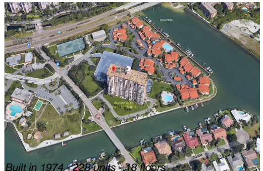
Built in 1974 - 228 units - 18 floors