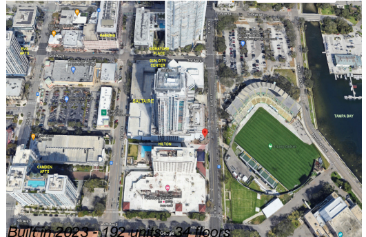
Built in 2023 - 192 units - 34 floors