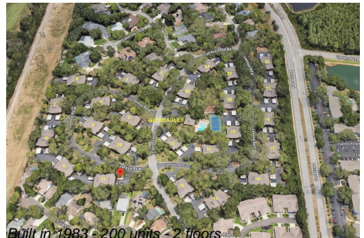
Built in 1983 - 200 units - 2 floors