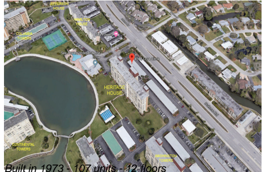
Built in 1973 - 107 units - 32 floors