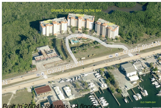
Built in 2004 - 84 units - 8 floors