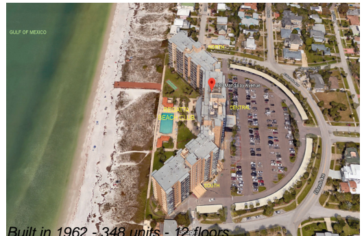
Built in 1962 - 348 units - 12 floors