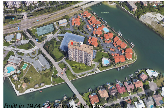
Built in 1974 - 228 units - 18 floors