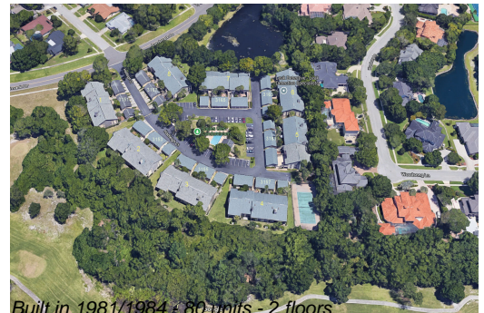
Built in 1981/1984 - 80 units - 2 floors