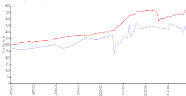
Captiva Cay vs St Pete Beach