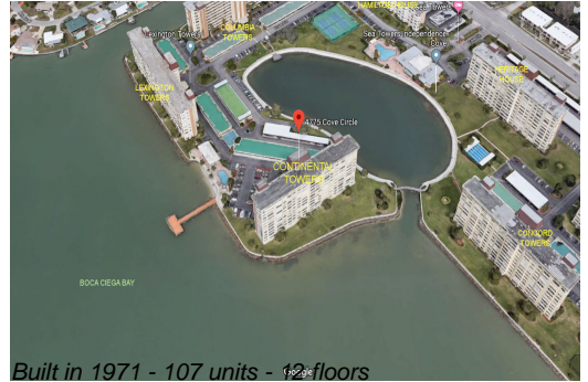
Built in 1971 - 107 units - 12 floors

MLS Number: U8227468 Status: ACTIVE Size: 560 Sq ft. Bedrooms: 0 Full Bathrooms: 1 Half Bathrooms: 0 Parking Spaces: Assigned, Guest View: Water List Price: $172,900 List PPSF: $309