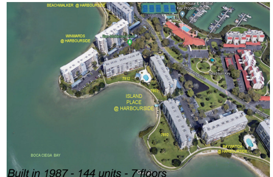
Built in 1987 - 144 units - 7 floors