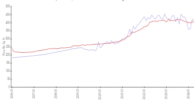
Waterside at Coquina Key South vs St Petersburg